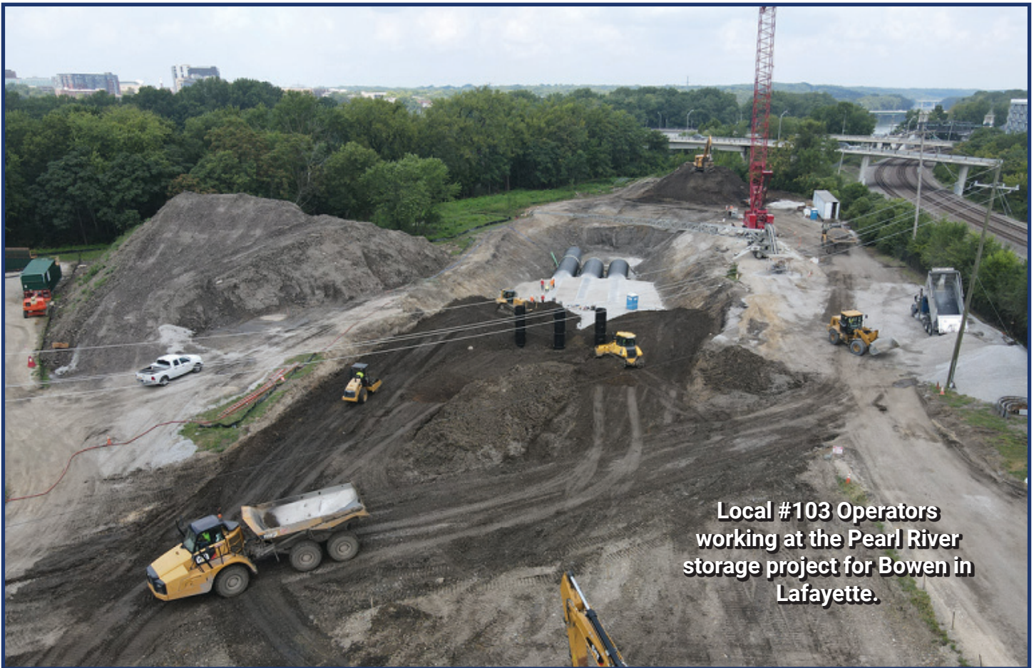
Local #103 Operators working at the Pearl River storage project for Bowen in Lafayette.

challenges that were placed on us. Fox and Fleming have had the lion's share of the housing developments in Dist. #2 northern counties with Brooks having the challenge to curb stone and asphalt for most of them. Bunn has wrapped up the new Meijer store and is beginning to break ground on the new Riverfront at Promenade Park mixed use building downtown near the ice rink. Fleming is working on placing 14,000 linear foot of pipe in Huntertown and E&B had a great year with placing roughly 340,000 tons of asphalt and over 2,300 cu. yds. of concrete. Brooks has paved 650,000 tons of asphalt and placed over 500,000 tons of stone.