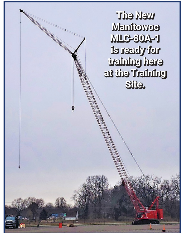
The New Manitowoc MLC-80A-1 is ready for training here at the Training Site.