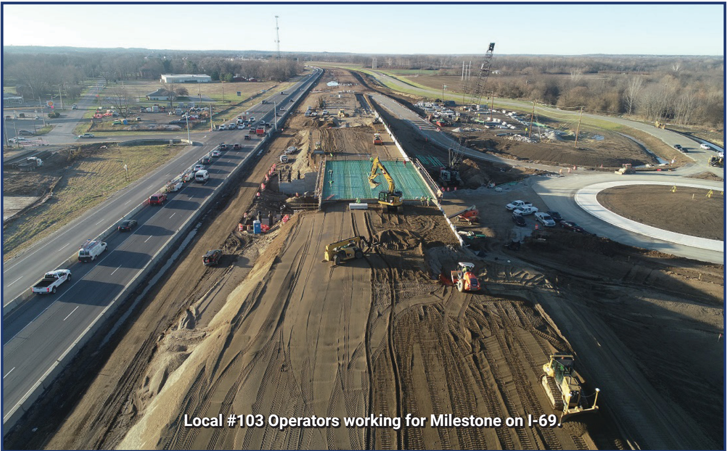
Local #103 Operators working for Milestone on I-69.