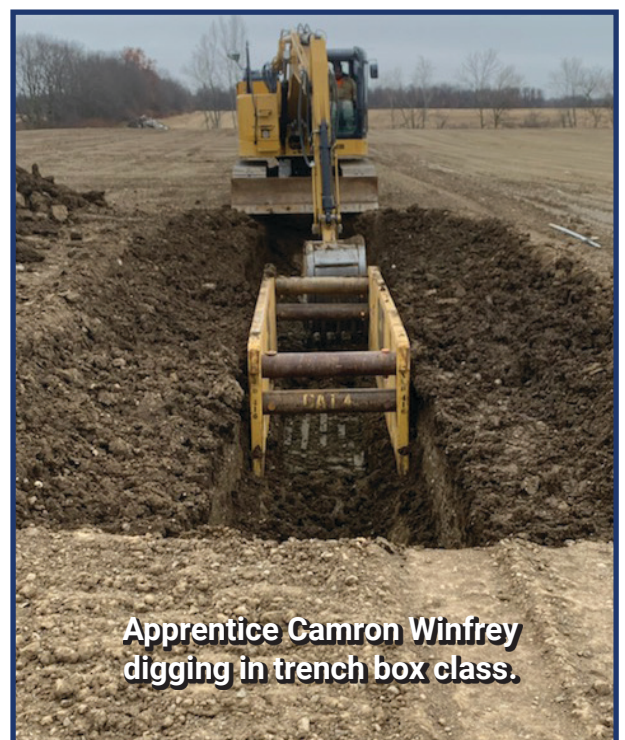
Apprentice Camron Winfrey digging in trench box class.

breaking $38.5 million investment with $29.1 million in road and bridge projects, $6 million in sidewalks and alley projects and $3.4 million in trail projects. The town of Huntington is bidding a $25 million sewer separation project with a $12 million water treatment plant in the planning phases for the town of Andrews. INDOT has multiple projects being bid throughout the five counties. The five northern counties of Dist. # 2 have been very successful in claiming some of Community Crossings grant mon-