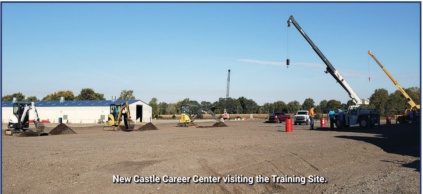
New Castle Career Center visiting the Training Site.

Work in western District 3 was busy this season, even with the shortage of materials. We had 5 housing additions this summer, a pipeline project, a windfarm project, a good-sized regulated drain project, for Tippecanoe County. Also, a couple total