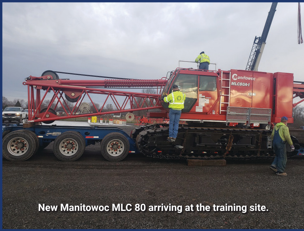
New Manitowoc MLC 80 arriving at the training site.

plant. HIS is finishing up work at the Portland airport extension and Milestone will be doing the asphalt in the spring. Fox is finishing up the Highway 3 project in Hartford City and E&B is doing the asphalt. Kokosing is