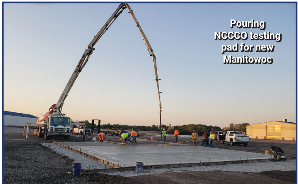
Pouring NCCCO testing pad for new Manitowoc